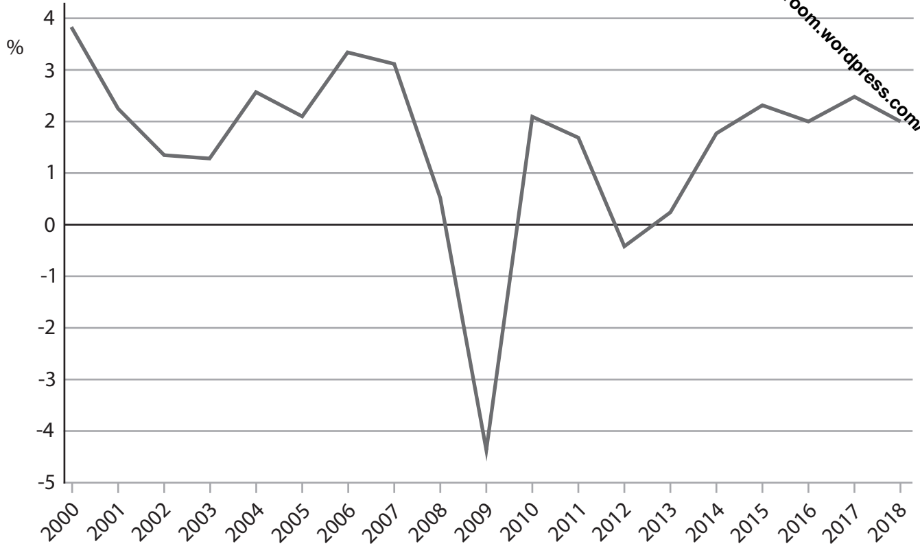
Figure 2 Annual inward foreign direct investment to the EU (% of GDP), 2000-2018