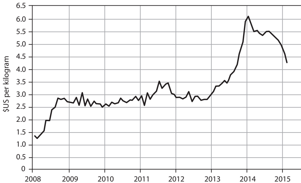
Figure 1 Price of quinoa, $US per kilogram