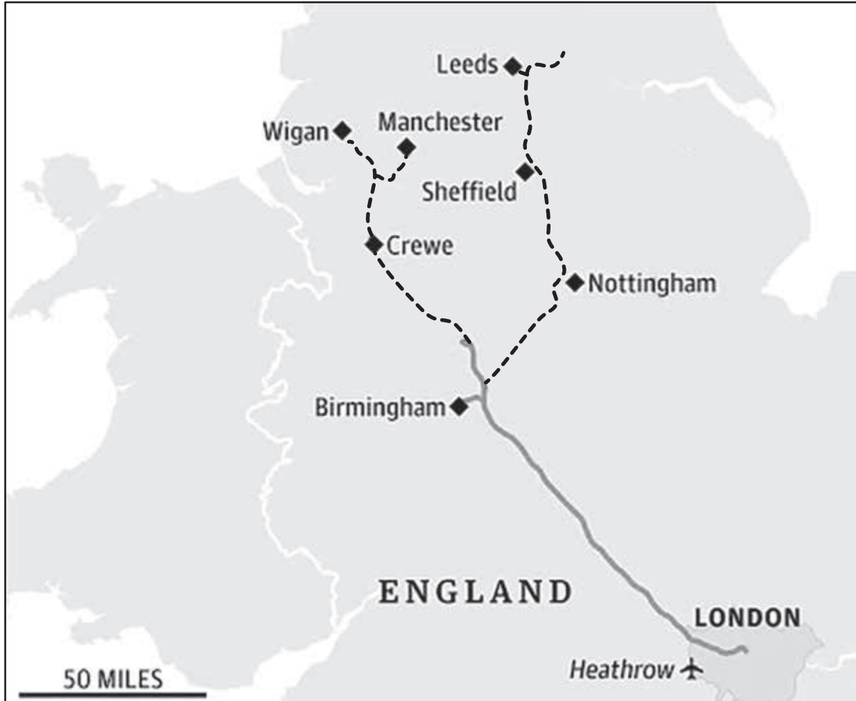
Figure 1 The HS2 route in England, UK